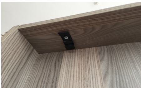
Above: 50mm from side, 30mm from front

Take your blind and make sure it fits perfectly. Take your bracket with the flat side facing the back, loop in front as per images. Measure 50mm from side, and 30mm from front edge of wall. This is where you should drill. Make a mark with a pencil.