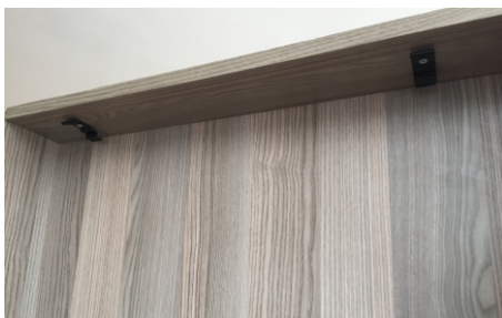
Above: Brackets fitted on sides.

Please note blinds wider than 1200mm will need supporting brackets in middle.