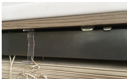
Above: Bracket closed and blind is fixed