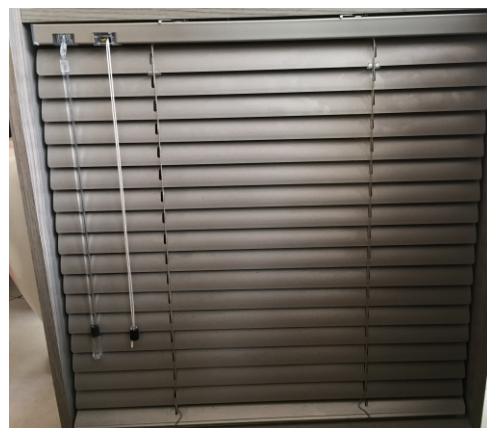
Above: Perfectly installed 25/35mm venetian

With the blind slats down, use the plastic operating wand to tiltz your slats by turning it clockwise and anti clockwise. Please do not pull on this.