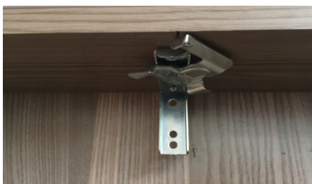
Above: Bracket in open position

Have all your brackets in the open position as per above image. Place your blind over the brackets, push blind up and secure flush with the top recess of your wall. Now while holding your blind up with one hand, use the other hand to close your brackets one by one. Before letting go of your blind, test that the blind is nice and secure.